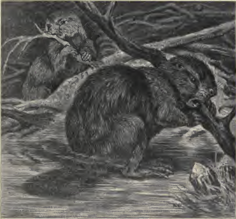
FIG. XXXI. CASTOR C. FRONDATOR. SONORAN BEAVER.